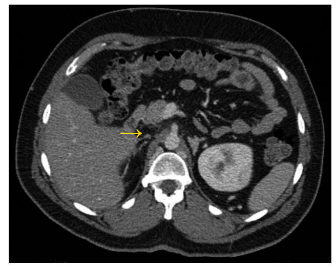
Figure 2 – Axial abdominal computed tomography shows absence of the suprarenal segment of inferior vena cava (arrow)

pelvis was then performed and disclosed absence of the suprarenal portion of the IVC (Fig. 2), with extensive venous collateralization through the azygous and lumbar veins (Fig. 3). The patient was treated in a conservative fashion with