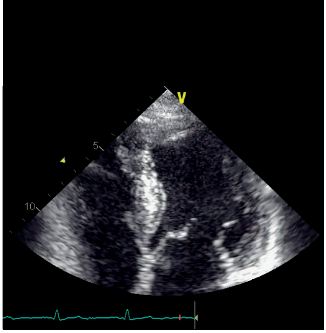
Figure 2 – Control transthoracic echocardiogram showing the complete resolution of the vegetation in the mitral valve