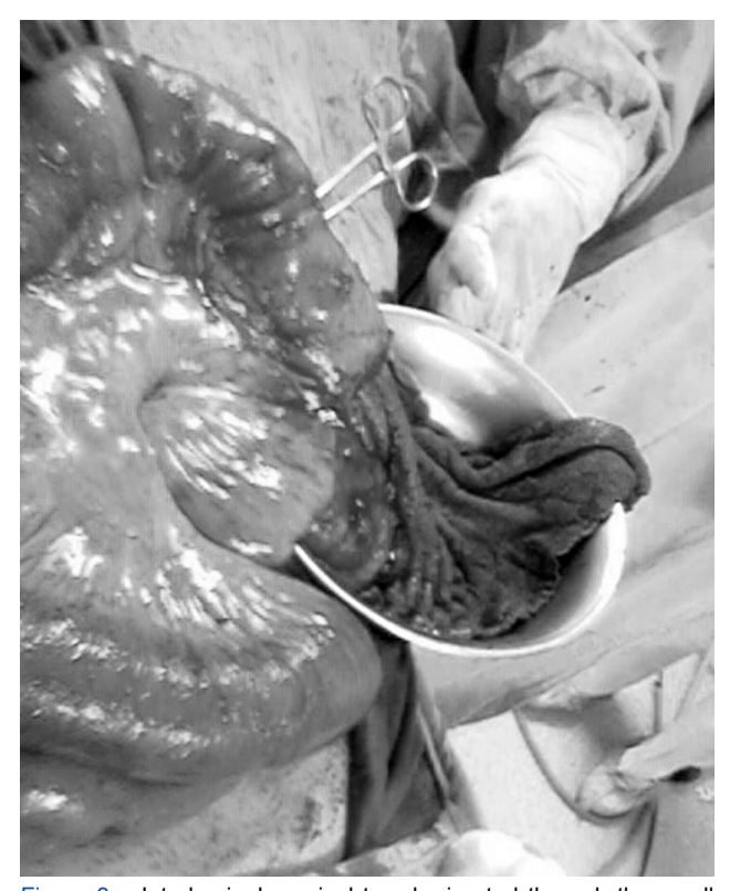
Figure 3 – Intraluminal surgical towel migrated through the small intestinal wall into the intestinal lumen (without symptomatic bowel perforation, but penetration without any anatomical sequela) causing mechanical intestinal obstruction found incidentally during laparotomy