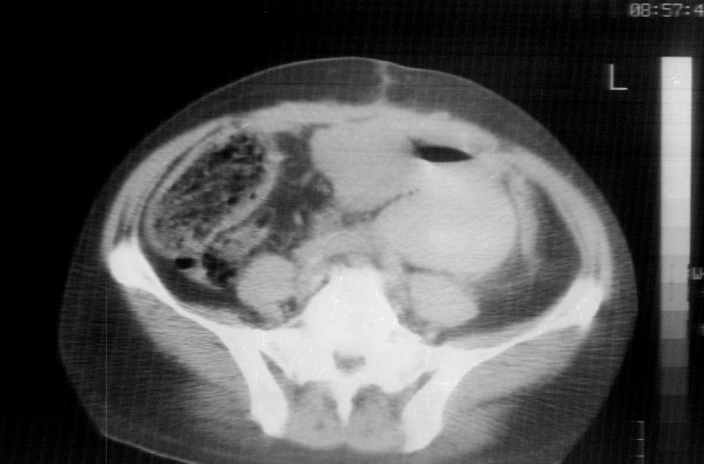
Figure 1 – Pathognomonic well demarcated characteristic mass including entrapped gaseous areas in the core and calcified cavity walls are almost a rule on computed tomography images in our series