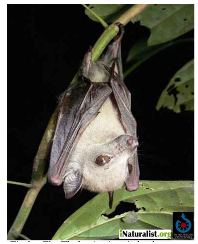
Figure 2 – Ebola virus main's bat host, the flying fox Myonycteris torquata, in a photograph from Wikipedia

Ebolavirosis are a group of zoonosis, infections able to jump among several different hosts. 1-4 Hundreds of mammal species had already been found infected with Ebola virus, however not a single case of a non mammal animal has been reported infected - apparently birds, reptiles, insects, and all other non mammal animals are naturally resistant to infection with these virus. Among the mammals, two patterns of infection are patent: bats are able to be infected and infectious apparently for life, with no symptoms,