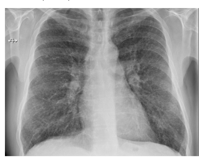
Figure 2 - Chest X-ray from a patient with LCH and lung involvement. A micronodular pattern, predominantly from the upper lobes and the perihilar region may be observed, sparing the costophrenic angles.

At the time of the initial examination, patients described: respiratory complaints (pneumothorax, persistent cough, imaging finding) - six patients (37.5%); bone complaints (pain, dysmorphia) - six patients (37.5%); dental complaints (odontalgia, mobility, spontaneous loss of teeth) - four patients (25%); constitutional symptoms - three patients (19%); mucocutaneous lesions were described by one patient, while in one patient the diagnosis was obtained unexpectedly within the histological examination of a thyroidectomy sample, with a concomitant thyroid papillary carcinoma (Table 1).