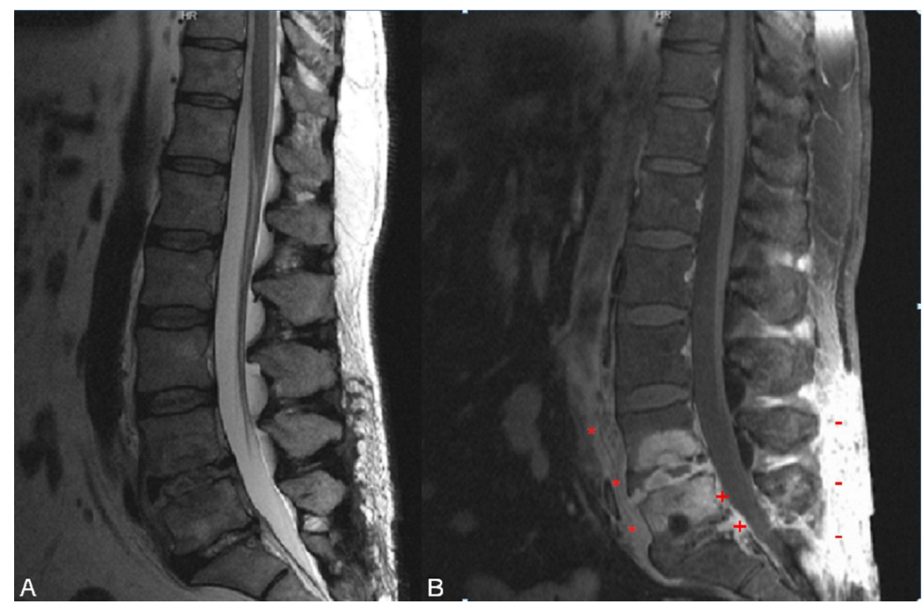
Figure 2 — Fat-suppressed post-contrast T1 (B) and T2 (A) weighted sagittal view MRI of the spine of one patient from our study showing major L4-L5 intervertebral disc and adjacent vertebral endplates involvement. There are less severe changes in the L5-S1 disc, with prevertebral extension (*), contiguous epidural (+) and inter-spinal posterior soft tissues (-) components. There is signal intensification of the intervertebral discs in T2 (A), with a clear post-contrast enhancement of L4 and L5 discs and vertebral bodies (B). This image highlights the relatively dominant involvement of the vertebral bodies when comparing with the vertebral discs, a feature that may help to differentiate brucellar from other pyogenic spondylodiscitis, namely from tuberculosis, which is usually characterized by a clear vertebral deformity.

Paravertebral and epidural abscesses may arise associated with BS<sup>14</sup>, having been identified in 29.6% of our patients.