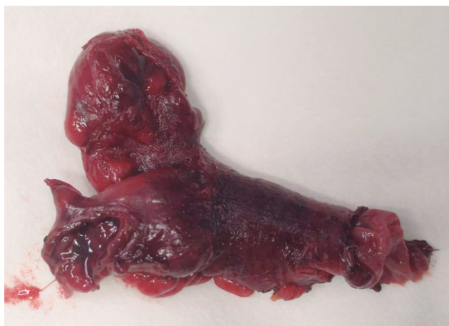
Figure 1 – Resected ileal segment with the broad-base Meckel diverticulum

Emergency surgery was performed. The hernia sac opening revealed a strangulated MD on the antimesenteric border of the ileal loop (Fig. 1). Segmental ileal resection, including the broad-base diverticulum, was performed, followed by side-to-side mechanical anastomosis. The atrophic undescended right testis was identified, and orchidectomy was performed, followed by Lichtenstein hernioplasty, an open tension-free technique that reinforces the posterior wall of the inguinal canal with a prosthetic mesh. In this case, a lightweight polypropylene mesh was used. The operative time was 100 minutes. The histopathological examination confirmed a MD. The right testicle was atrophic, with obliteration of the seminiferous tubule lumen, and there was a scarce number of Leydig cells, without malignancy. Re-evaluation at one month showed no hernia recurrence, and, at six months, the patient was asymptomatic.