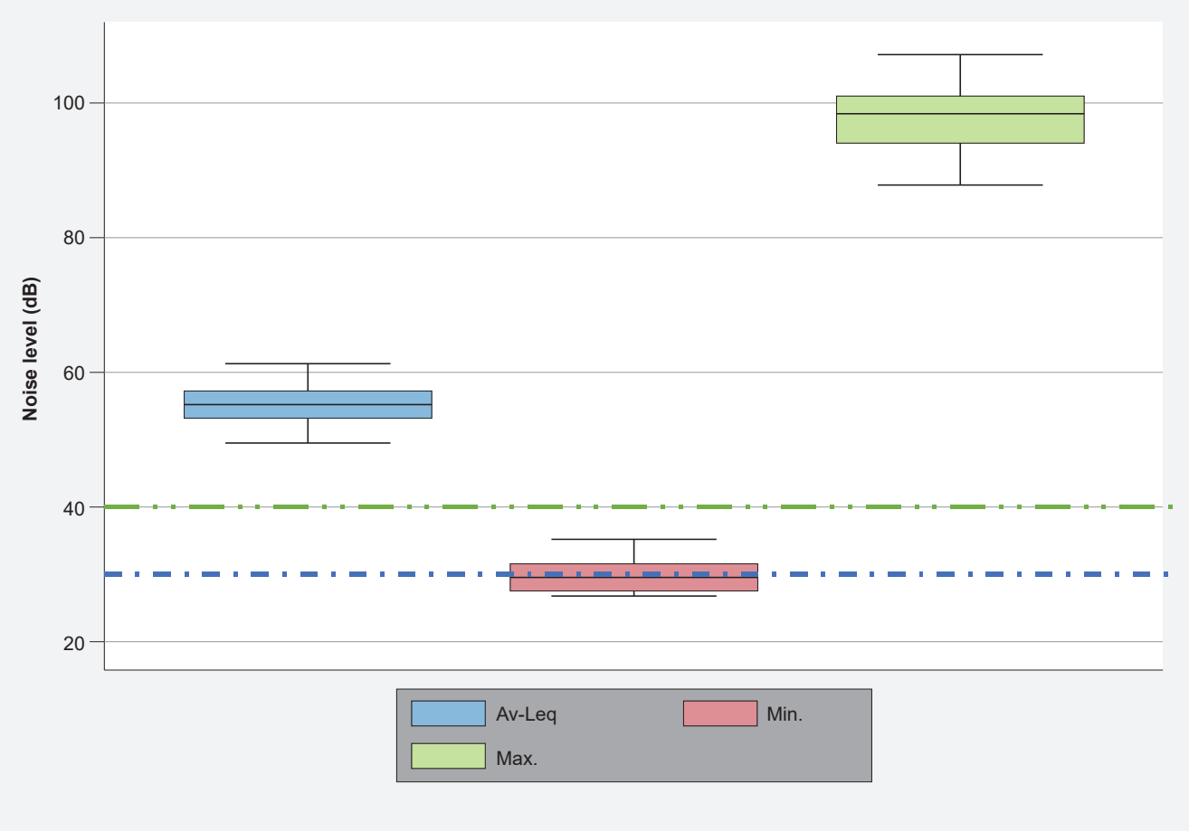
Figure 2 – Average, minimum and maximal noise levels (dB) in acute medical ward. Dashed lines represent the WHO average (LAeq 30 dB) and maximum (LAmax 40 dB) noise levels recommended in hospital wards.<sup>2</sup>