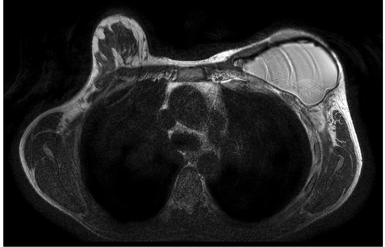
Figure 5 - Breast MRI, T2 axial: left periprosthetic fluid and invasive mass extending through the capsule to the homolateral chest wall

phenotype; somatic mutations with JAK/STAT3 signaling pathway activation; and the biofilm theory proposed by Hu et al but not supported by Walker et al in 2019.<sup>9</sup>