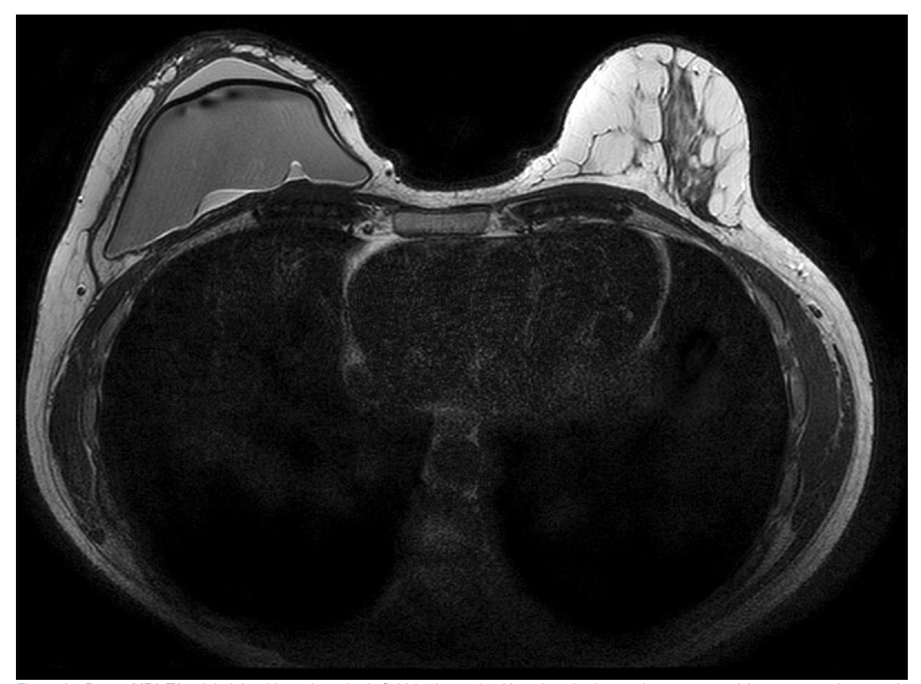
Figure 2 – Breast MRI, T2 axial: right-side periprosthetic fluid (red arrow), with no lymphadenopathy or any suspicious mass at the capsule

without post-operative complications (Fig. 3). The pathological examination of the surgical specimen confirmed BIA-ALCL – Stage IA by tumor, lymph node, metastasis (TNM)