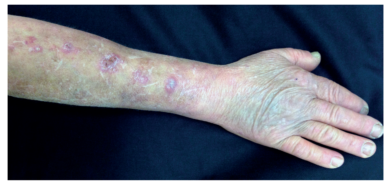
Figure 1 – Alternaria infectoria skin infection. Erythematous nodules in a sporotrichoid distribution on the dorsal aspect of the right forearm.