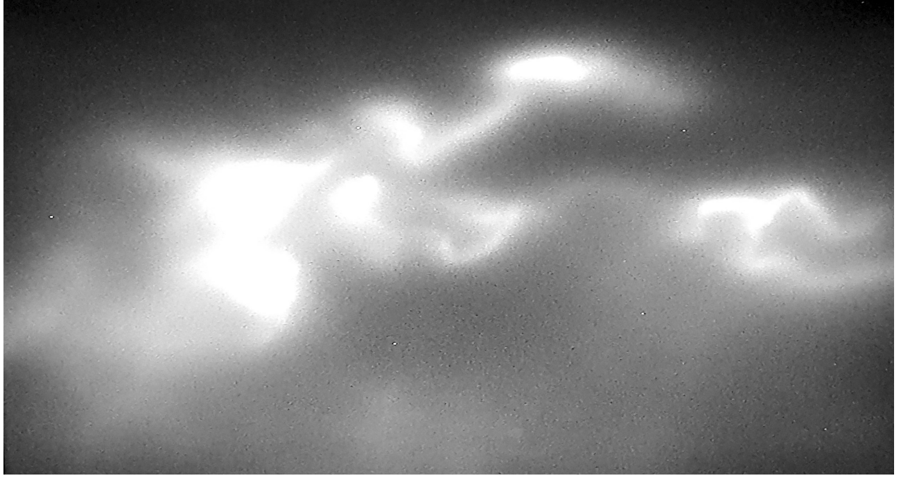
Figure 2 – Splash pattern on the medial aspect of the thigh above the knee

ma are limited to the early stages of the disease. When the fluid dominant edema progresses to adipose dominant edema and then to fibrosclerotic dominant edema, surgical options are limited to liposuction and direct excision respectively. Lymphaticovenular anastomosis can be performed as long as there are functioning lymphatics.<sup>6</sup> This