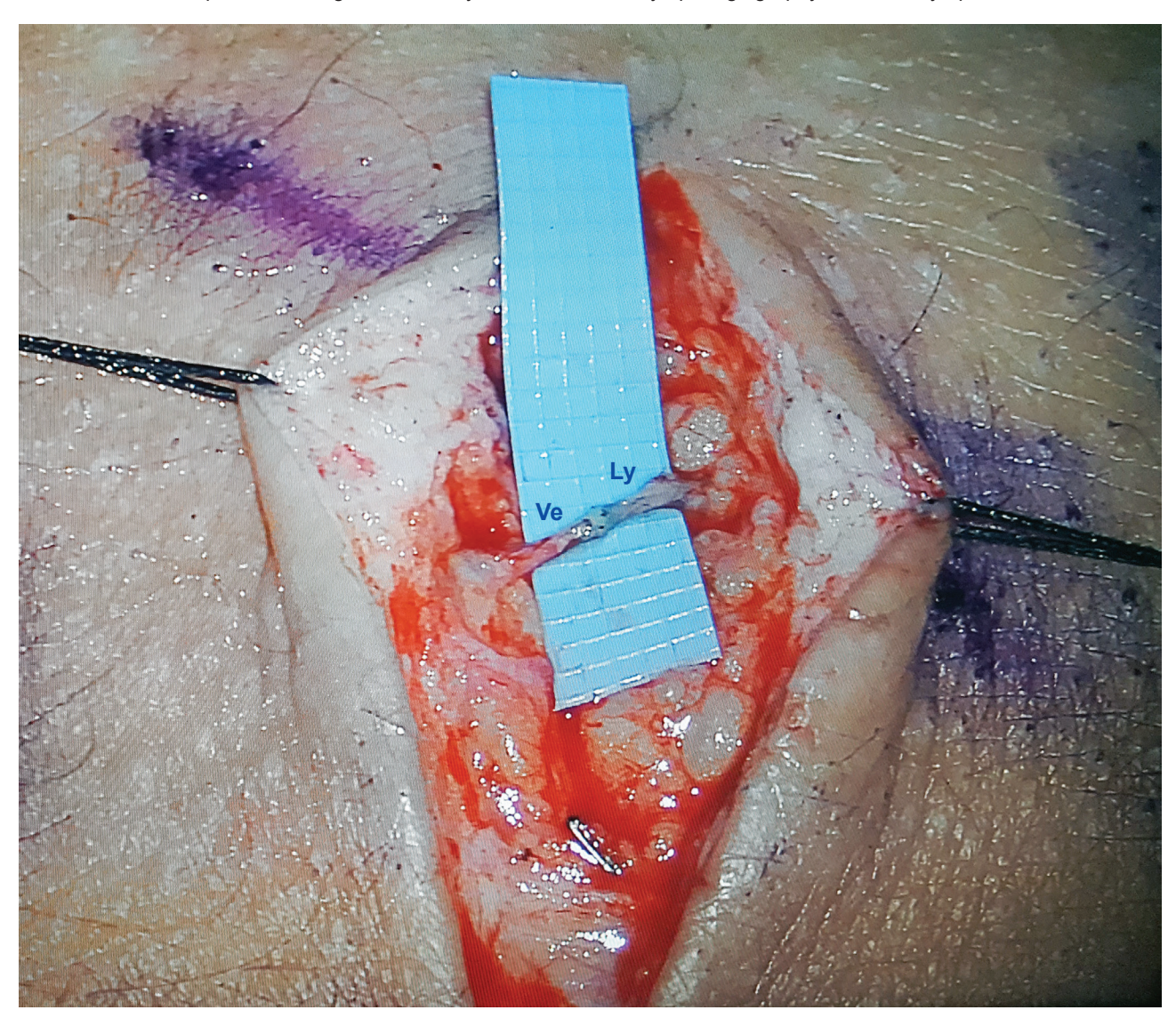
Figure 3 – Lymphaticovenular anastomosis on the medial aspect of the thigh above the knee, superficial to the superficial fascia. Ly: lymphatic; Ve: venule

This patient had two perpendicular scars on the medial aspect of the thigh in the distal third, which is probably a consequence of external fixator placement. Given the high probability of injury to the lymphatic system at this level, although the lymphoscintigraphy did not show a localized blockage, it was of the utmost importance to perform lymphaticovenular anastomosis distally. Fortunately, the lymphangiography revealed lymphatics at this level.