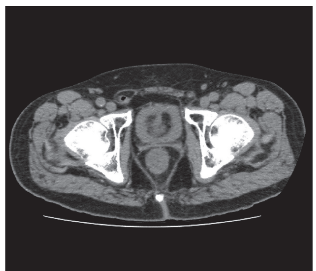
Figure 1 – Amyand's hernia: abdominal and pelvic computed tomography, axial plan, showing the appendix extending into the right inguinal canal without signs of inflammation, infection or perforation

Keywords: Hernia, Inguinal/diagnosis Palavras-chave: Hernia Inguinal/diagnóstico