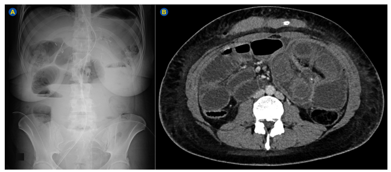
Figure 1 – Abdominal plain radiography (A) and CT scan (B) showing air-fluid levels and jejunojejunal intussusception

enteric fluid in the peritoneal cavity and a significant dilation of both biliopancreatic and alimentary limbs, secondary to a 25 cm retrograde intussusception of the common limb, involving the jejunojejunostomy, was found. The invaginated limb had irreversible ischemia with perforation at the jejunojejunostomy. The ischemic bowel (common limb) was resected including the jejunojejunostomy. The latter was reconstructed with two lateral-lateral jejunojejunal anastomosis (alimentary limb with common limb and biliopancreatic limb with common limb distally) to redo the RYGB. The resultant alimentary limb had approximately 140 cm. Fig. 2 shows the intra-operative findings.