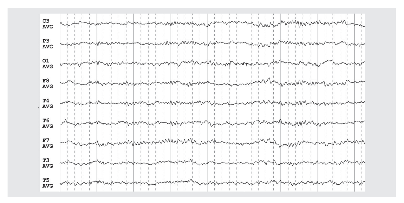
Figure 2 – EEG recorded with patient awake revealing diffuse theta-delta waves

Three years after discharge, the patient has a normal neurological examination and showed a clear improvement in repeated neuropsychological assessment, revealing only a mild deficit in working memory and learning ability. Nowadays, he is only taking azathioprine 200 mg/day and