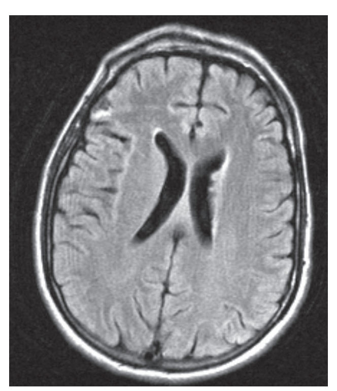
Figure 4 – MRI showing right fronto-opercular lesion compatible with head trauma

In the present case, our patient had a psychotic episode at the age of 27 and although anti-NMDAR antibodies